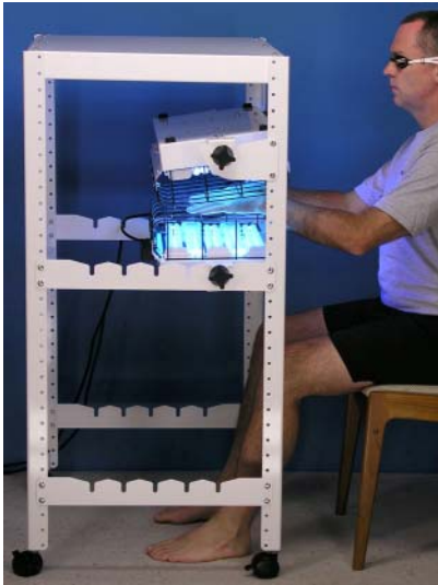
A setup to treat the top and palms of the hands simultaneously.