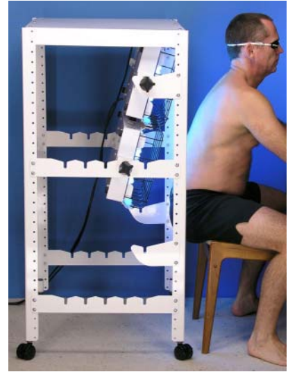
The possibilities are endless...

The "Clinic Rated" SolRx 550UVB-NB-CR provides maximum versatility for busy clinics. Modern Philips 36-watt PL-L36W/01 compact fluorescent bulbs provide considerably greater UVB-Narrowband Irradiance and shorter treatment times than competitive devices using conventional 20-watt "T12" bulbs. With two devices mounted in the optional Positioning Cart, the treatment possibilities are endless. Also available as UVB-Broadband, UVA or UVA1. Please visit SolarcSystems.com/550cr_clinicRated.html for more information. Clinic Warranty: 2 years on device, 6 months on bulbs; plus our Arrival Guarantee