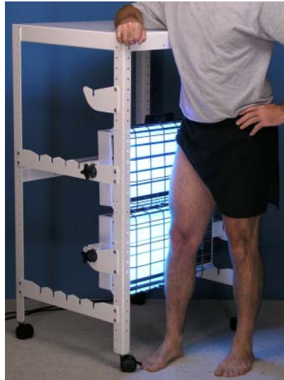
Or stack the devices to create a small panel.