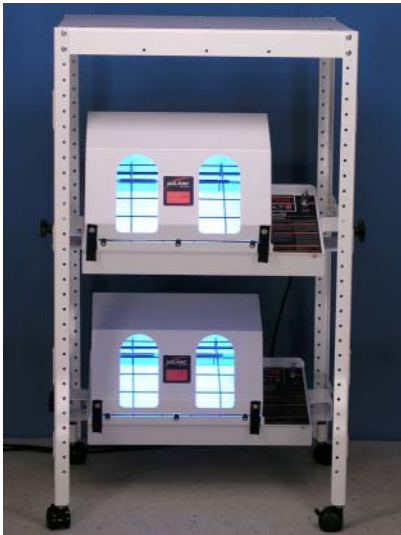
Two 550UVB-NB-CR devices in a typical hand & foot arrangement. Lockable castors provide mobility.